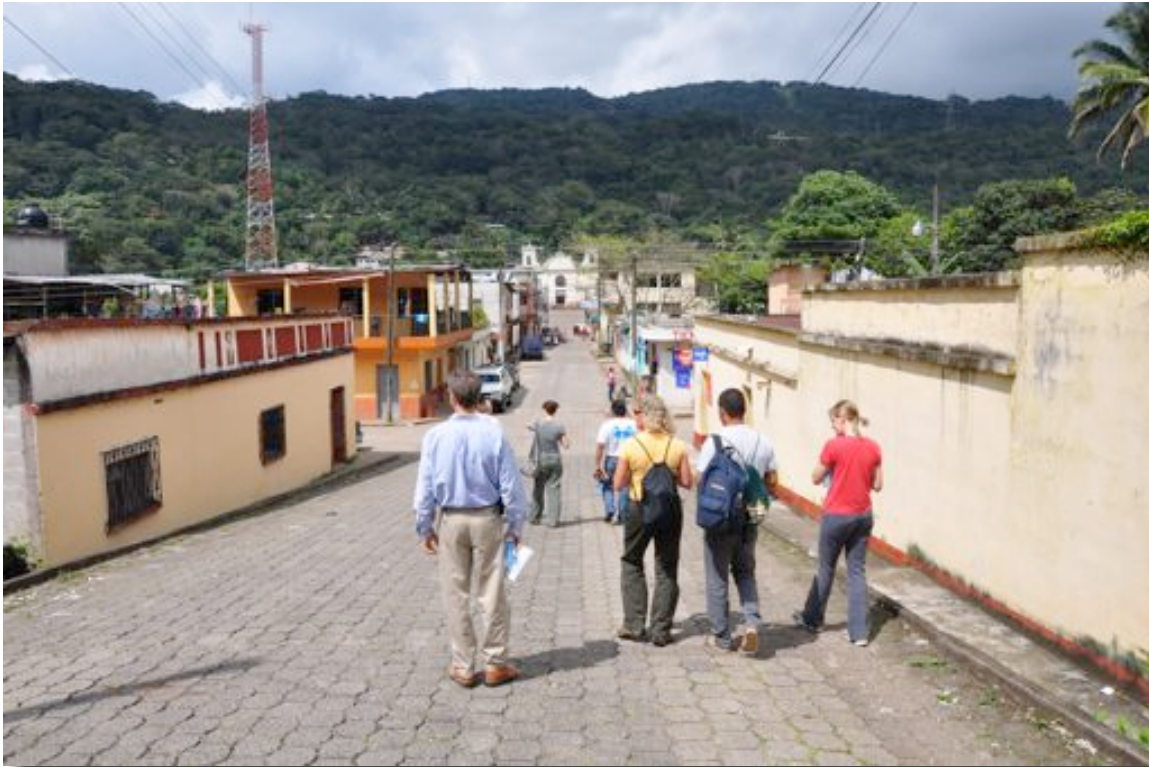
Town of Oratorio