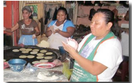
Women making pupusas in the market

We shared local customs one evening when we met seven of our hosts at a pupuseria in their home town of Chiquimulilla. It